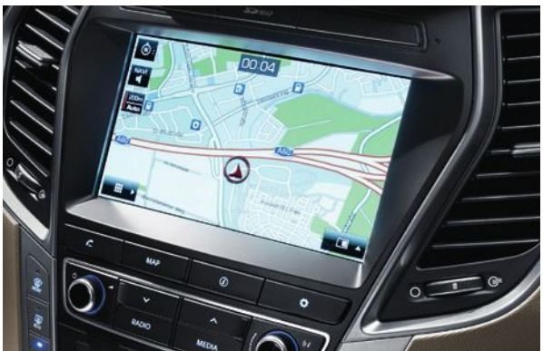
Audio Visual Navigation System.* The high-quality navigation system combines a full-colour 8" TFT touch-screen with the broadcast clarity of DAB digital radio.