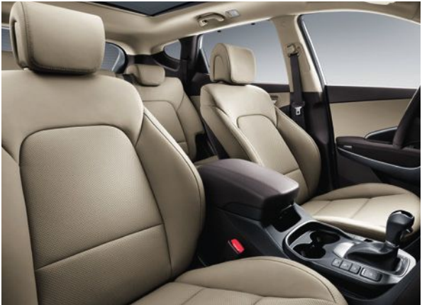
Beige Leather two tone.*

*Available on Phantom Black and Ocean View exterior colours.