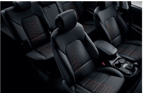
Heated seats. Enjoy the welcoming warmth of heated front and rear seats. Available on Executive and Premium model.