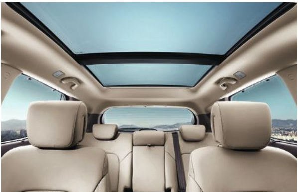
Panoramic sunroof. The extra-large panoramic sunroof adds the feel of open-air driving at the touch of a button. A discrete wind deflector automatically minimises wind noise and buffeting. Panoramic Sunroof available on Premium model.

It starts with supportive, well-proportioned seats in a roomy, ergonomically optimized cabin. That's tangible comfort for all on board. But in the new Santa Fe, comfort also defines the way you feel. It's a sensation of wellbeing sustained by high-quality materials and premium features that will keep you relaxed, entertained and informed throughout even the longest journeys.