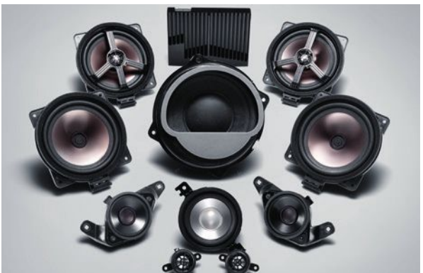
Infinity Premium Surround Audio. Twelve speakers, 630 Watts and the QuantumLogic Surround (QLS) system treat all occupants to a rich, multi-dimensional surround sound experience. Available on Premium model.

Disclaimer: Leather available on Executive and Premium models.