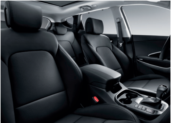
Black Leather one tone (Also available in cloth)**

*Available on Phantom Black and Ocean View exterior colours.